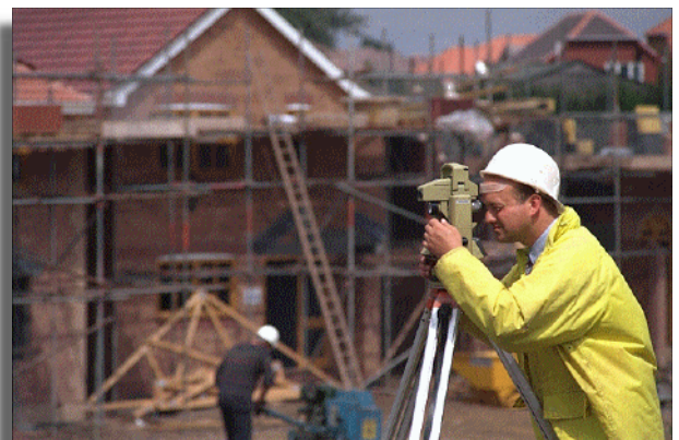
Topographic Site Survey

For further information on the above contact