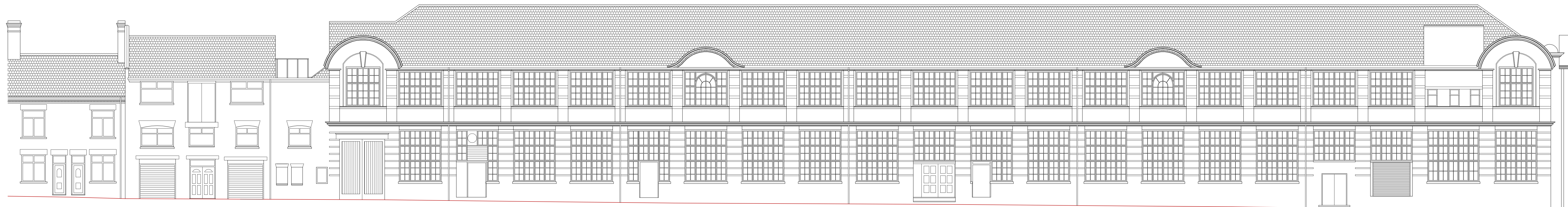
VERNON STREET ELEVATION