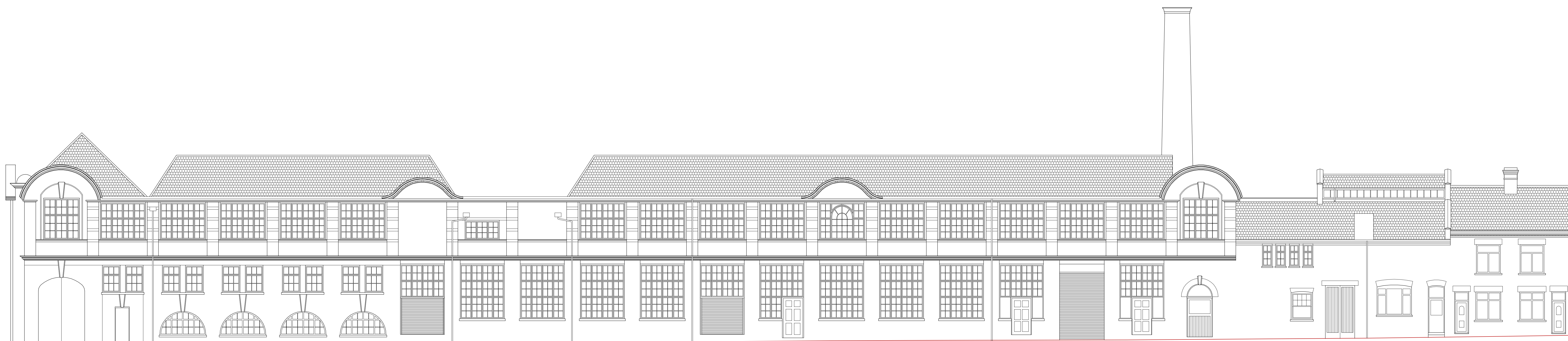
NUGENT STREET ELEVATION