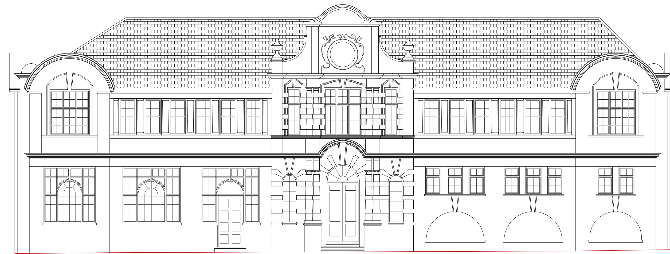
TUDOR ROAD ELEVATION